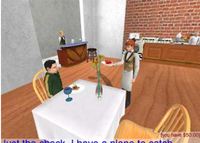
Just the check. I have a plane to catch. Figure 1. Screenshot from The Restaurant Game .

Here's your pie. Will there be anything else?