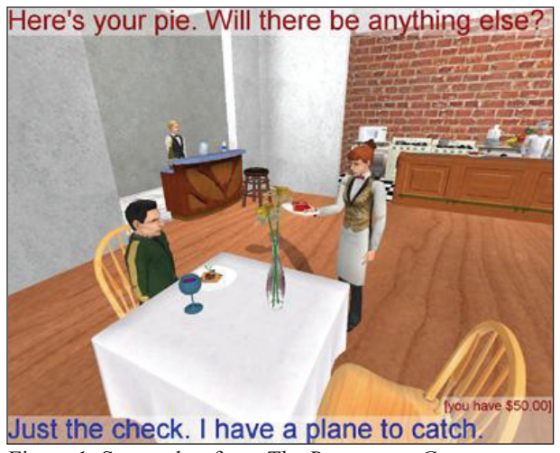
Figure 1. Screenshot from The Restaurant Game.

Tokenizing actions and chat text is more complex than tokenizing source code, due to the fact that actions refer to objects which change state over time, and open-ended